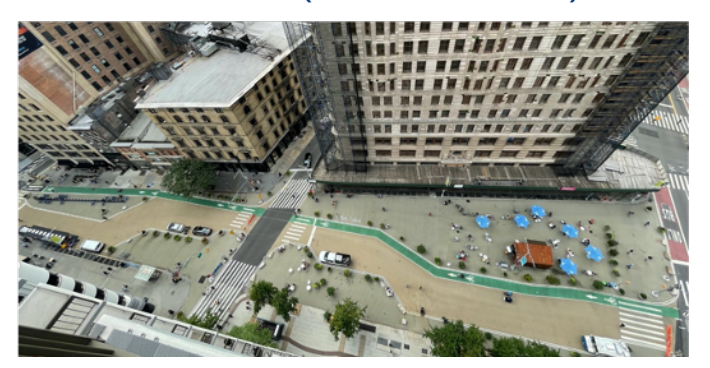
Added pedestrian space and seating amenities with a 5MPH advisory speed limit