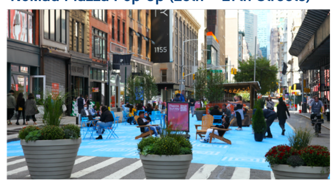
Temporary plazas (October – early November) build off NYC DOT's successful Open Streets & outdoor dining programs

Ground floor lease signings increased this quarter, and none more so than on the Broadway corridor. 15 ground floor businesses either opened or announced lease signings on Broadway including Mezze (900 Broadway), Timothy Oulton (901 Broadway), Le Pain Quotidien (921 Broadway), Bungalow 5 (933 Broadway), Gumption Coffee (940 Broadway), Tortazo (1123 Broadway), Joe & The Juice / Chaps & Co NYC / Borsalia (1165 Broadway), L'Adresse (1184 Broadway), and The Glass Ceiling (1204 Broadway).